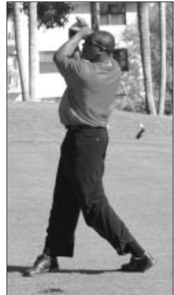
Marlins' pitcher Dontrell Willis shows great form in yet another sport.