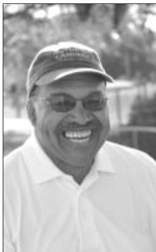
Former Dodger Tommy Davis is a fan favorite.