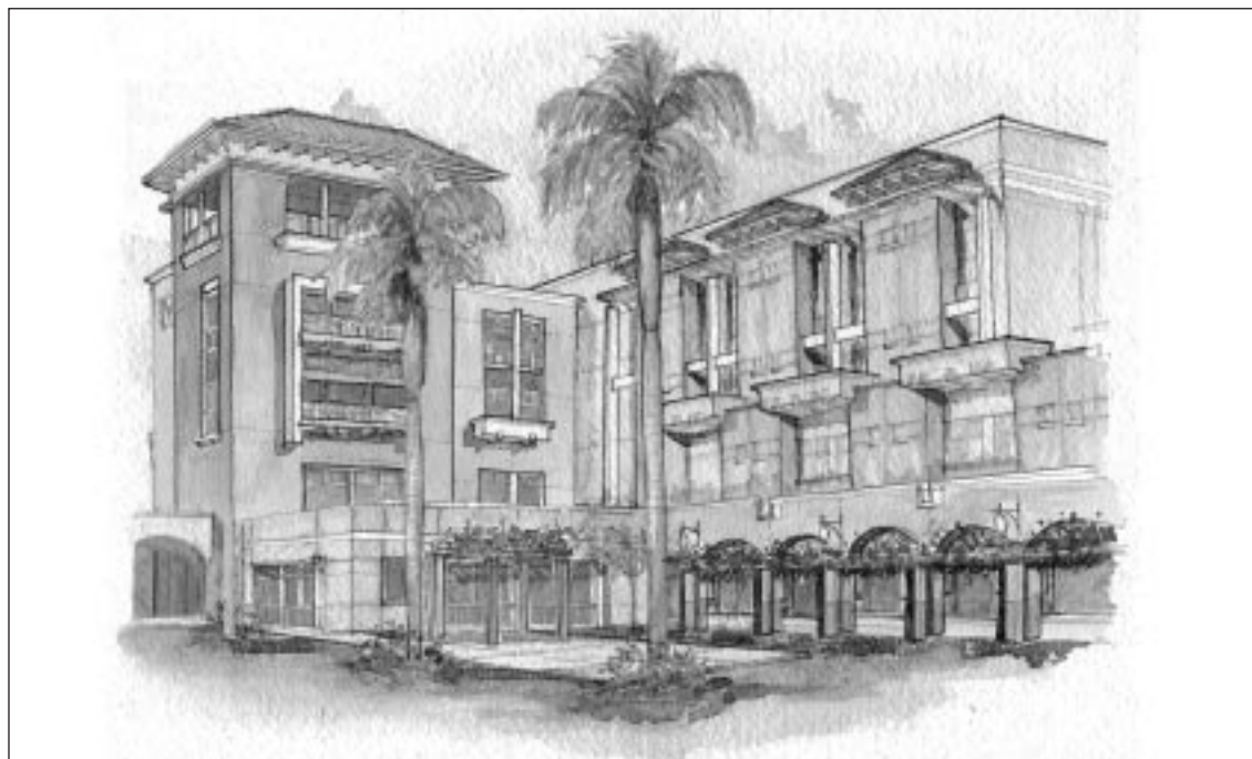
Patio view of Memorial Hospital Miramar.

For more information about Memorial Hospital Miramar or the Medical Office Building, please visit the Memorial Healthcare System website at www.memorialmiramar.com .